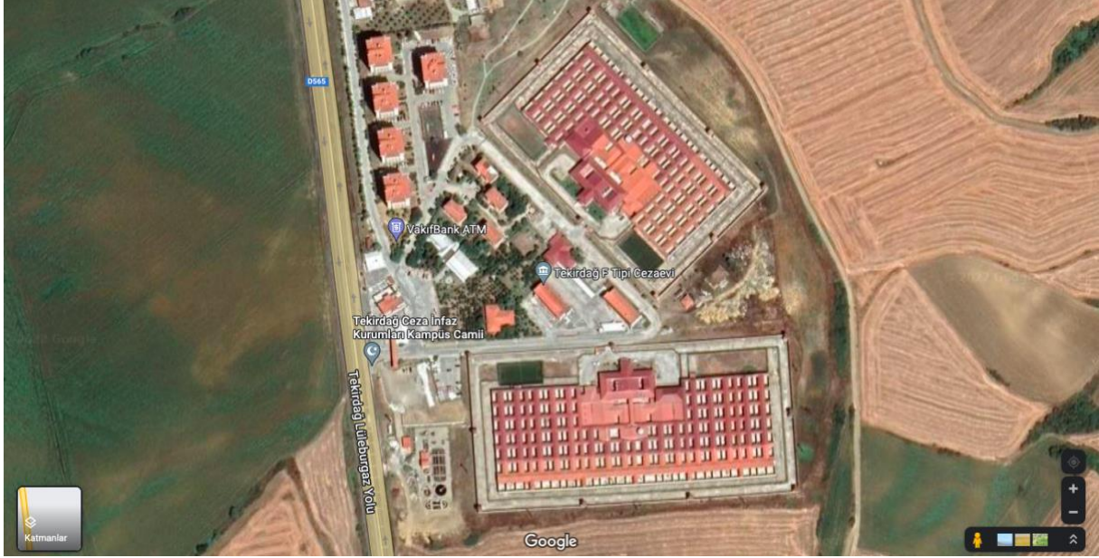
Tekirdağ No 1 and No 2 F Type High Security Closed Penal Institution

F-Type prisons were opened in a wave in the early 2000s, and no additional facilities of this type have been built since. As of September 1, 2022, there are 14 F-Type high-security prisons in Turkey: