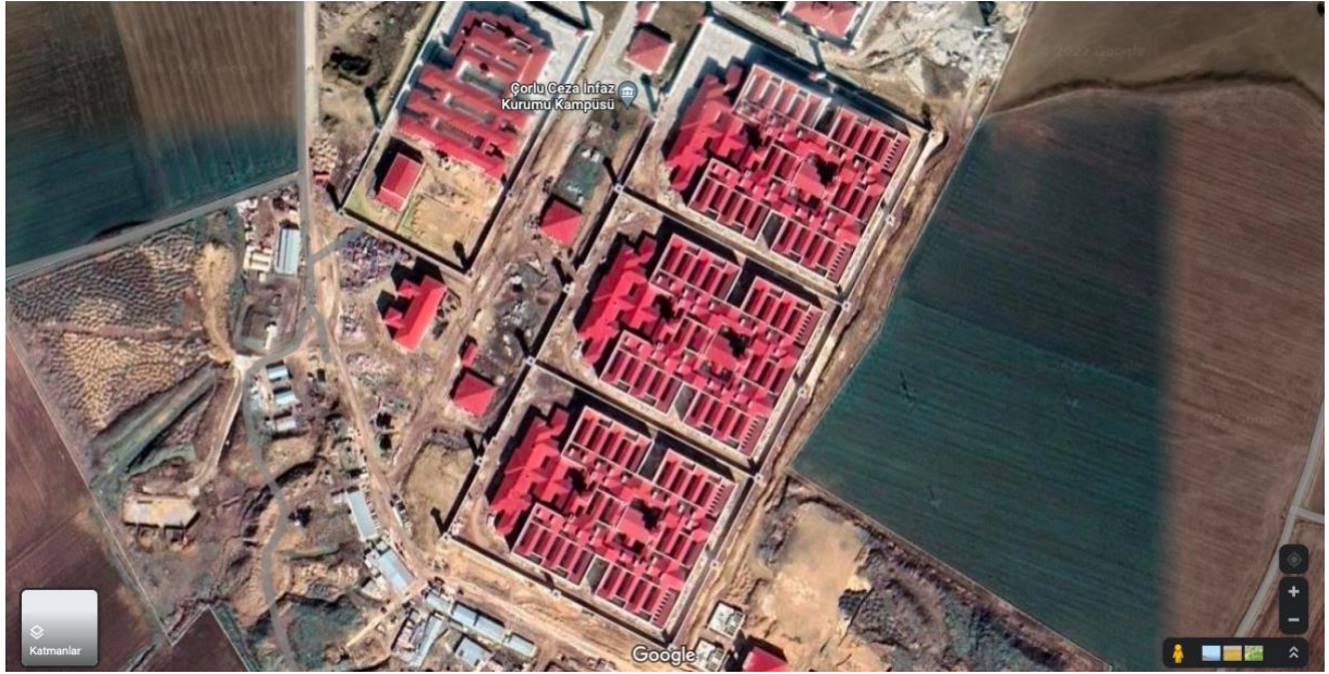
Çorlu Penal Institutions Campus

From the outside, the architecture of these prisons appears to be identical to that of the Y-Type prisons. The two photos below clearly illustrate this resemblance.