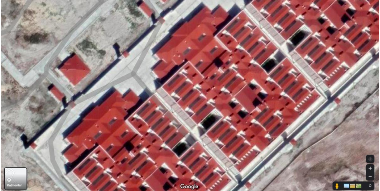
Ereğli No 1 and No 2 Y Type Closed Penal Institution

Although media reports vary regarding the capacity of these prisons, both the official website of the Ereğli Penal Institutions Campus and the Ministry of Justice's 2021 Annual Activity Report state the capacity as 1,135.