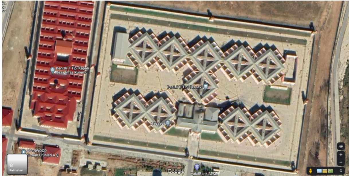
Denizli D Type Closed Penal Institution

As can be seen in the image below, D-Type prisons stand out as having the most distinct architectural style among all Turkish prison types.