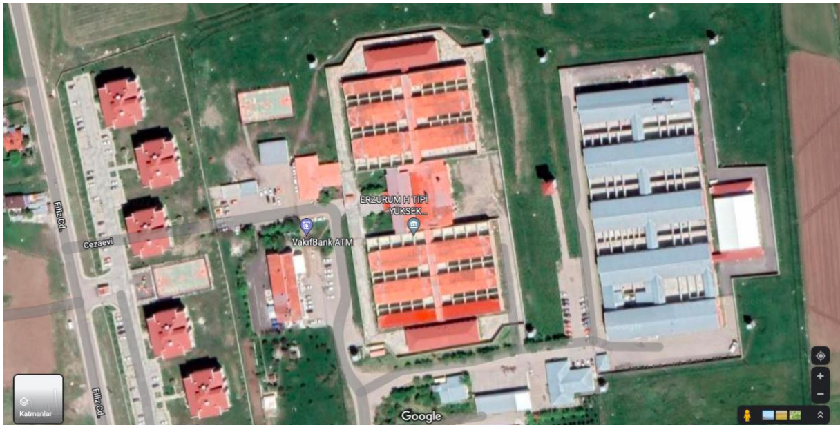
Erzurum H Type High Security Closed Penal Institution

The prison consists of two sections and twelve blocks, including seventy-nine duplex units designed for four inmates each, and twenty-six single-occupancy disciplinary cells (solitary confinement units) (Erzurum H-Type official website, 2022). The total capacity of the prison is 316 inmates. vi